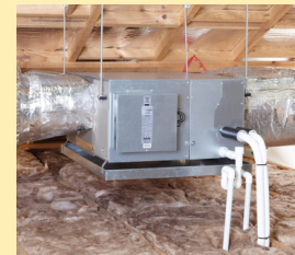
Ducted heat pump