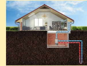
Geothermal heat pump

This same heat-transfer concept is also applied in heat pump water heaters, heat pump clothes dryers, and geothermal heat pumps.