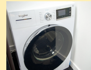
Heat pump clothes dryer