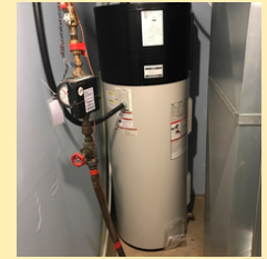
Heat pump water heater