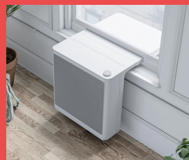
In-window heat pump

Heat pumps use electricity to move heat between locations, even in temperatures below 20 degrees, by tapping into the energy present in the atmosphere. While not all are designed for extreme cold, certain models can keep your home warm without requiring an additional heating source, even when it's colder than -20°F outside. It is important to consult with installers with choose the right technology for you, as certain heat pumps may not perform as well in colder climates.