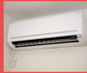
Ductless heat pump

A heat pump is an all-in-one electrical device that can take the place of both a typical air conditioner and a home heating system (such as a furnace or boiler).