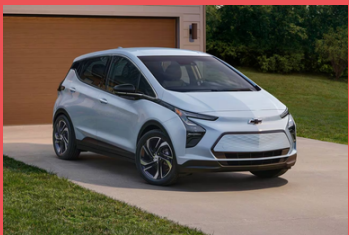
Eligible 2023 Chevrolet Bolt (3)

Electric cars offer significantly lower operating costs compared to gas-powered vehicles. With rising and fluctuating gas