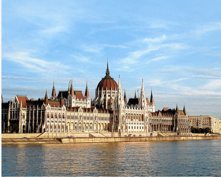
Parliament Building, Budapest

Join this custom-designed, 13-day travel program visiting seven countries, one UNESCO World Heritage sites and the enchanting eastern Danube River Valley , a mystical region steeped in natural beauty that remains virtually unknown to Westerners. Cruise for nine nights aboard the exclusively chartered, deluxe AMADEUS SILVER II from the Habsburgs' imperial capital of Vienna to the Black Sea . Here, a rich mosaic of medieval cities, charming villages and rugged countrysides await you, from the ancient lands of Bulgaria to the relatively young territories of Serbia and eastern Croatia , the spectacular Carpathian Mountains and Hungary's fabled Puszta (plains) to the glittering palaces of Budapest . Admire a masterful display of traditional horsemanship in the Hungarian heartland, immerse yourself in the Slavic heritage of medieval Belgrade and cruise through the dramatic Iron Gates , which divide the Carpathian and Balkan Mountains . Spend two nights in Romania's elegant capital of Bucharest, known for its splendid architecture. Deepen your knowledge of the Danube with the Vienna Pre-Program Option and see authentic castles of local lore on the Transylvania Post-Program Option.