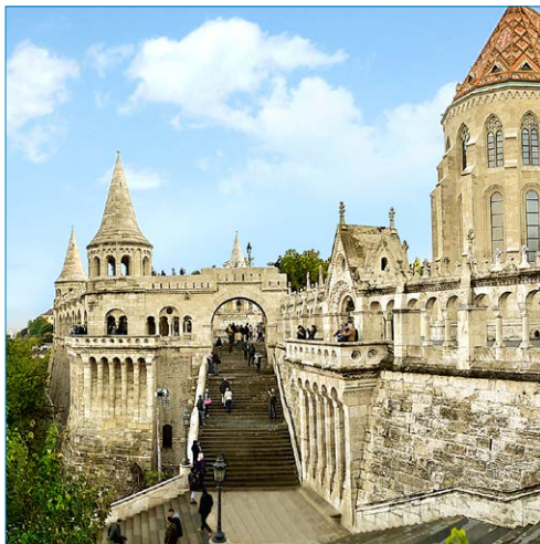
Fisherman's Bastion, Budapest

Scenic transfer from Fetești to Bucharest.