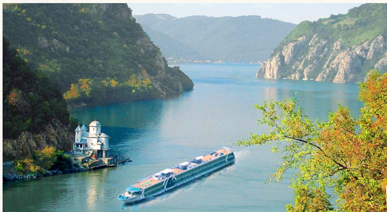
Iron Gates, Serbia

Join this custom-designed, 13-day travel program visiting seven countries, one UNESCO World Heritage sites and the enchanting eastern Danube River Valley , a mystical region steeped in natural beauty that remains virtually unknown to Westerners. Cruise for nine nights aboard the exclusively chartered, deluxe AMADEUS SILVER II from the Habsburgs' imperial capital of Vienna to the Black Sea . Here, a rich mosaic of medieval cities, charming villages and rugged countrysides await you, from the ancient lands of Bulgaria to the relatively young territories of Serbia and eastern Croatia , the spectacular Carpathian Mountains and Hungary's fabled Puszta (plains) to the glittering palaces of Budapest . Admire a masterful display of traditional horsemanship in the Hungarian heartland, immerse yourself in the Slavic heritage of medieval Belgrade and cruise through the dramatic Iron Gates , which divide the Carpathian and Balkan Mountains . Spend two nights in Romania's elegant capital of Bucharest, known for its splendid architecture. Deepen your knowledge of the Danube with the Vienna Pre-Program Option and see authentic castles of local lore on the Transylvania Post-Program Option.