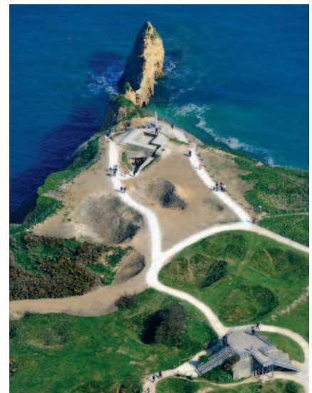
Pointe du Hoc