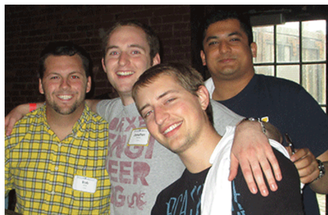
Drexel young alumni and graduating seniors network and enjoy a night out at Barcade

Save the date for Alumni Weekend 2015 on Friday, May 1 and Saturday, May 2 and join us back on campus for another weekend of blue and gold fun!