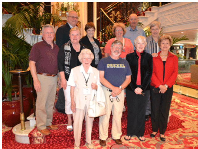
Drexel alumni and guests enjoying the Alaskan Frontiers & Glaciers Alumni Travel Program in July.

Space is limited, so alumni who are interested in participating in a New Student Send-off should please contact the Office of Alumni Relations at alumni@drexel.edu or 1-888-DU-GRADS. Click here for the full list of upcoming send-off locations.