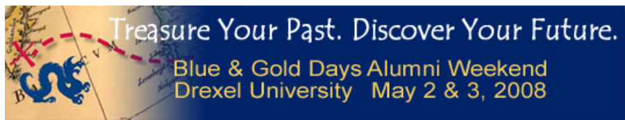
Chart your course for Blue & Gold Days Alumni Weekend 2008 on May 2 and 3 , and return to campus for a true Drexel adventure!

DREXEL HOME | ATHLETICS | ALUMNI | DRAGONET | ALUMNI MAGAZINE | DAILY DIGEST | GIFTS ONLINE | DETAIL ARCHIVE | CONTACT US